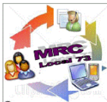
Member Resource Center